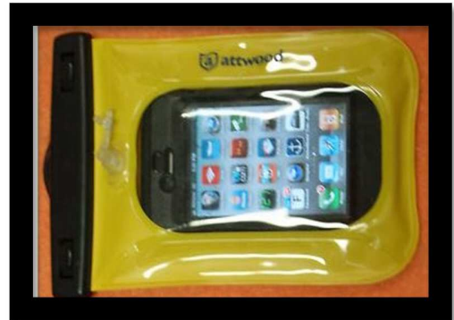
Waterproof Phone Case $50