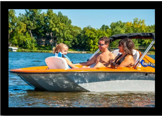
Vortex Jump Seat $205