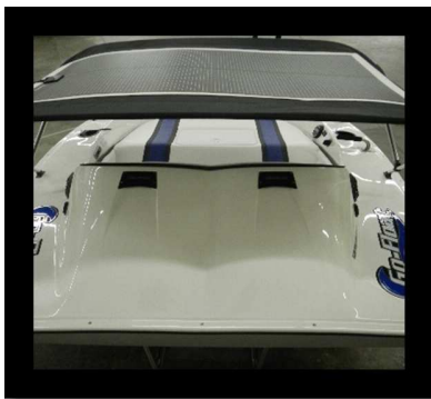
Solar Bimini Top $1045