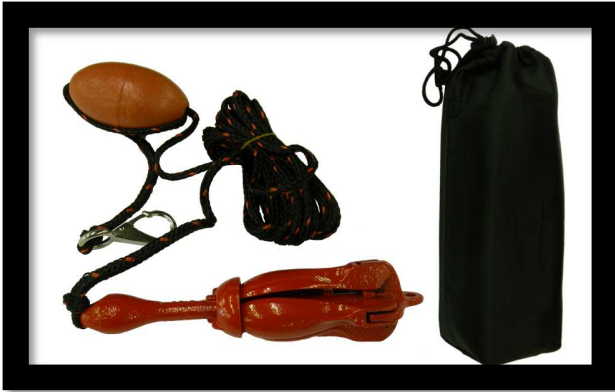
Anchor with Storage Bag $65

Thank you for purchasing your new Go-Float Electric Boat! We are confident that you will enjoy your Go-Float for years to come. There are several attractive accessories available for your Go-Float. Please contact your nearest Go-Float Dealer, visit www.Go-Float.com , or call 952-955-9500.