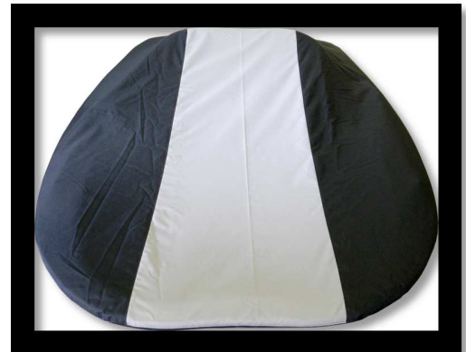
Boat Cover $245 Solar Boat Cover $995