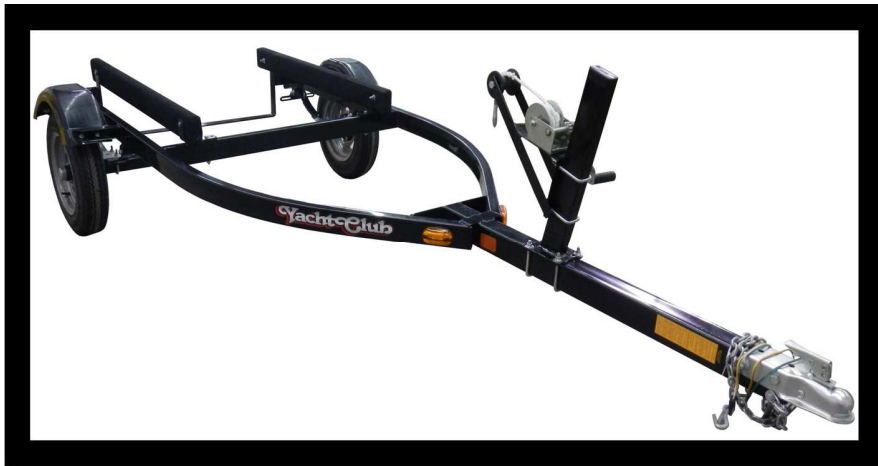
Trailer, Single Axle, No Brakes $1095