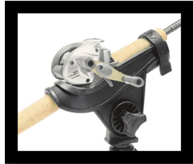
Rod Holders (L&R) $150