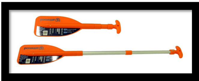
Collapsible Paddle $45