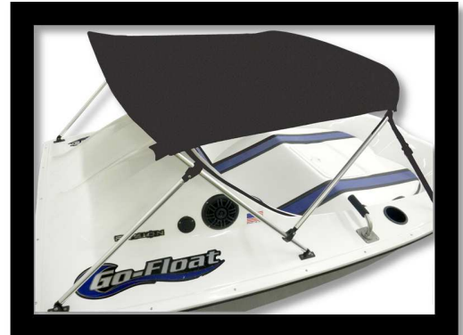
Bimini Top $265